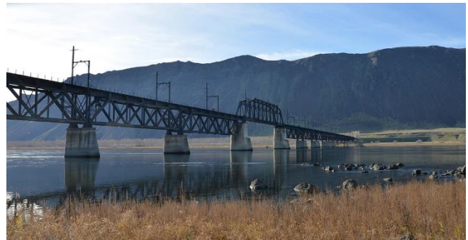
Beverly Bridge.